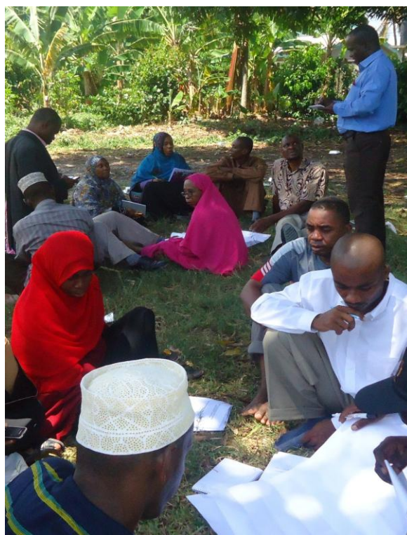
Paralegals from Pemba and Unguja involved in group work during a paralegal forum in Pemba

Trainees receive during the training period in which they are supposed to start functioning as paralegals a combined transport and communication allowance in the range of TShs 50,000 per month. During the first ever paralegal forum the LSF organized in Zanzibar the first batch of trainees who had finished informed, that all of them had retired, since the allowance, due to fund constraints, had been terminated. As a consequence it is not unlikely that of the approximate 250 to 300 paralegals who have been trained on Zanzibar only 20 - 30 % is actually functioning.