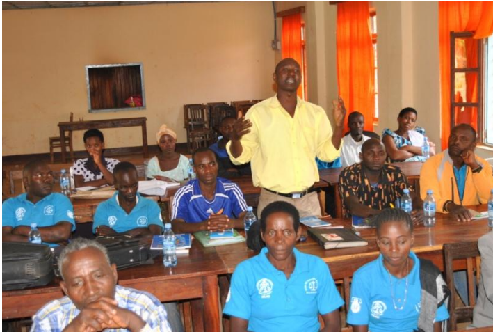
Paralegal training for WLAC paralegals in Kasulu district, Kigoma region

In order to implement and maintain such sustainable approach, in turn sustainable legal aid providers are a requirement. For LSF as grant maker this is a corner stone of the overall approach.