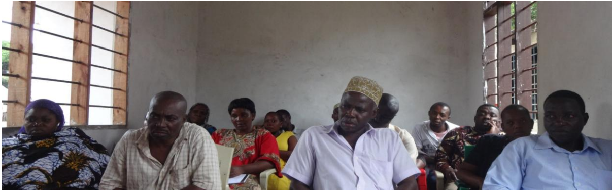
Meeting of LSF team with Mukuranga paralegal unit also attended by ward council member (2 nd right front) and various other local officials (1 st right and backward)

Still, in many parts of the country low engagement of paralegals with LGAs and informal local leaders prevails. Incidental collaboration is common, e.g. VEOs or WEOs invite paralegals in community assemblies. LGAs expressing appreciation for the role of paralegals are on the increase, but substantial collaboration still is rather rare and therefore a focus in this strategic plan.