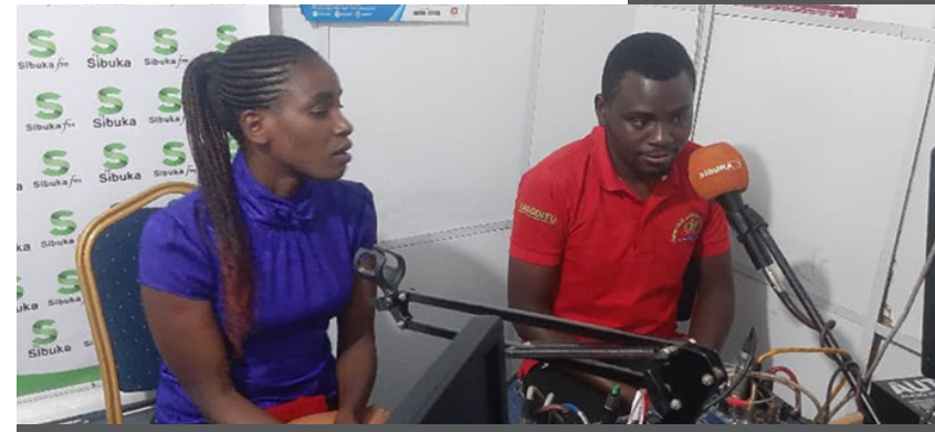
A Maswa-based paralegal, left, participates in a live radio session at Sibuka FM during a discussion on the coronavirus pandemic and the role of legal aid and education

As the presence of coronavirus continued to expand around the country, LSF encouraged organizations it funds across the country to devise means of not only availing legal aid and education with added precautions but also actively participate in the fight against the pandemic. It also provides necessary support and monitors all relevant initiatives undertaken by regional mentor organizations and paralegals against the pandemic.